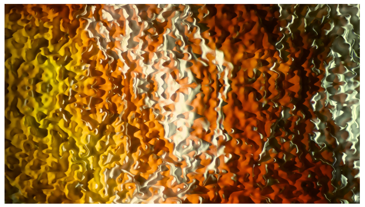
Patricia Olynyk, Dark Skies, video and sound installation, 8' x 8', 2016